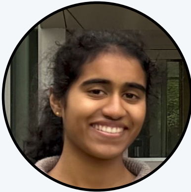
12 th Grade